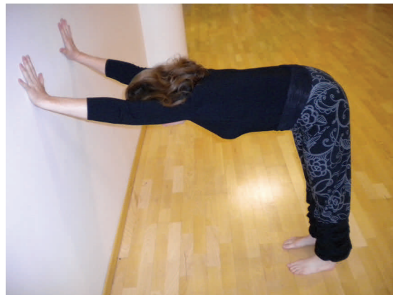
Downward dog on wall.

Standing up straight against the wall with feet shoulder width apart and about 2 feet from the wall; slowly bend forward (as if to touch your toes). Hold 10-30 seconds and slowly come back up. This exercise stretches the spine and the back of the legs (hamstrings).