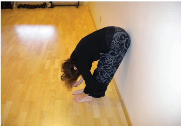
Forward fold at wall.

Begin by breathing deeply to stretch ribs and upper spine. Stand parallel to the wall with both feet together and arms up above your head. Slowly move both arms towards the wall, while keeping them straight. Place hands on the wall and hold 10-30 seconds. End by returning to your starting position.