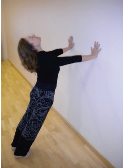
Upward dog at wall.

The American College of Sports Medicine (ACSM), recommends flexibility training a minimum of 2 to 3 days per week, holding each stretch for 10 to 30 seconds. Perform each stretch to a position of mild discomfort. Below is a Yoga workout that you can use at the office or at home. These exercises will improve your flexibility and prevent or reduce back pain. Perform each pose for 10-30 seconds. Repeat 3 to 4 repetitions for each pose.