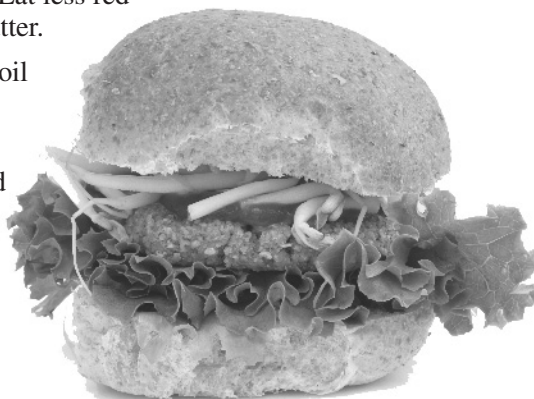
A veggie burger can be just as delicious as any hamburger.