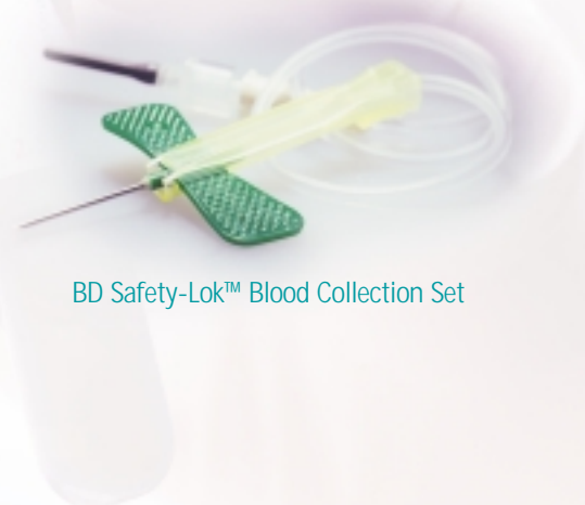
BD Safety-Lok™ Blood Collection Set

888.387.2381 (North America) 49.2103.29.12000 (Germany)