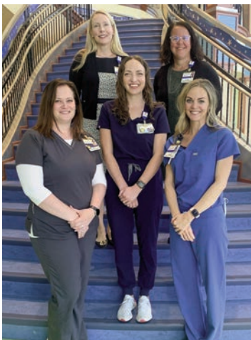
Pediatric Pre-procedure COVID testing team