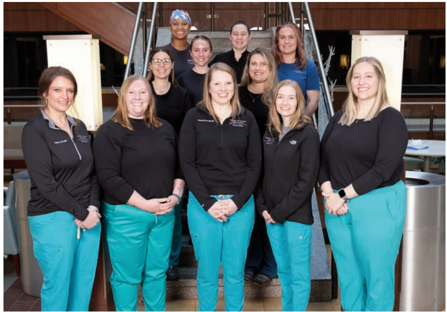
The Sexual Assault Nurse Examiner team receives extensive training in trauma-informed care.