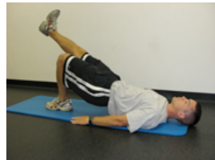
Single-Leg Supine Hip Bridge