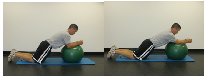
Prone Elbow Roll-Out on Physioball