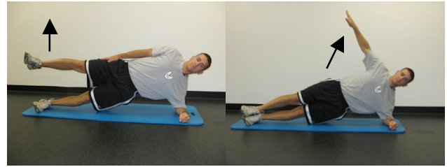
Side Plank with Hip/ Arm Abduction