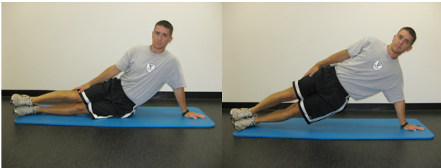
Side Plank on Outstretched Arm