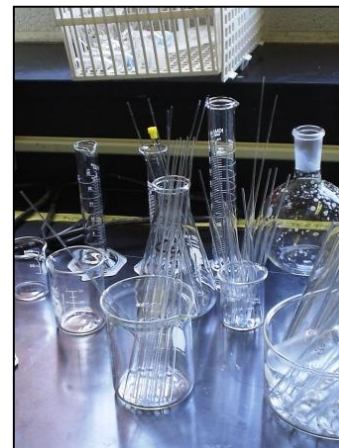
Non-glass options are available for many of the common lab ware items shown here.