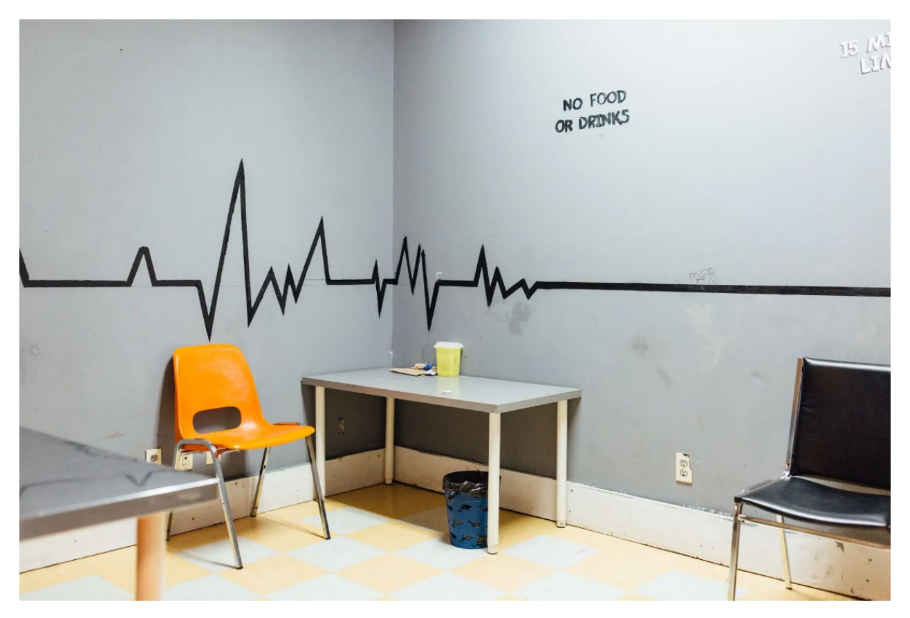
An overdose prevention site at the Vancouver Area Network of Drug Users.

But there are more than 85,000 people at risk of overdose in British Columbia every day, from daily users on the street to occasional users who don't live anywhere near a supervised injection site.