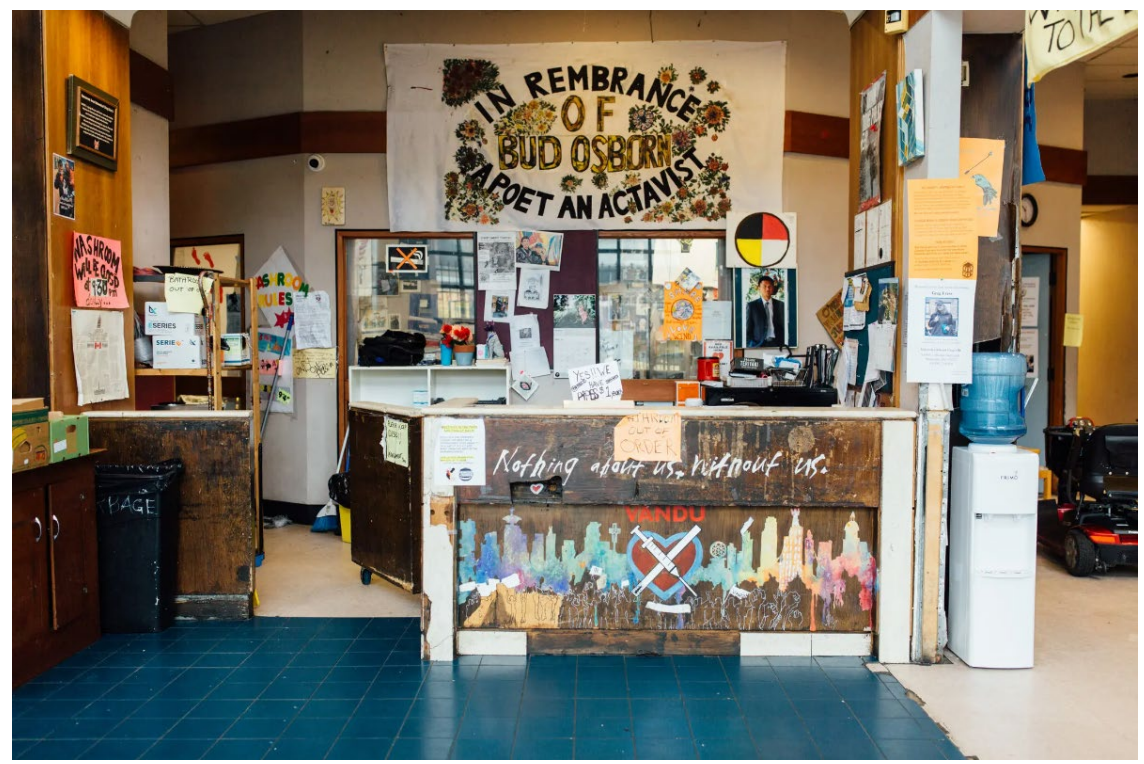
The lobby of the Vancouver Area Network of Drug Users, a peer support organization.