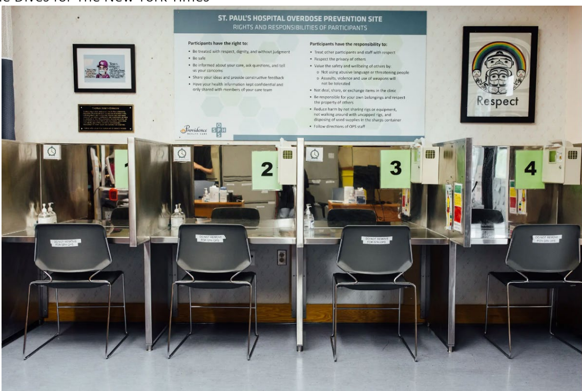
Injection booths at St. Paul's Hospital in Vancouver, the first hospital in Canada to offer an overdose prevention site in-house.

Fentanyl has largely displaced heroin and the opioid painkillers Dilaudid and OxyContin as the illicit drug most used in Vancouver, a shift underway throughout North America. It is also often cut into other drugs, including non-opioid prescription medications such as the attention deficit disorder medicine Adderall, which is sold on the street as a stimulant. Its potency and users' inability to know what they are buying or how strong it will be have led to the huge surge in overdoses.