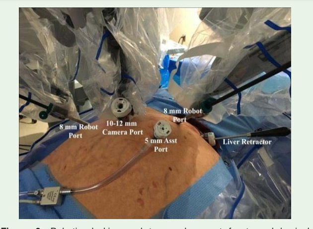
Figure 3: Robotic docking and trocar placement for transabdominal adrenalectomy in a super obese patient.