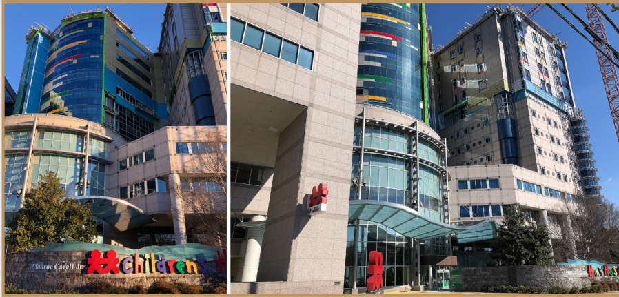
Monroe Carell Jr. Children's Hospital at Vanderbilt current expansion