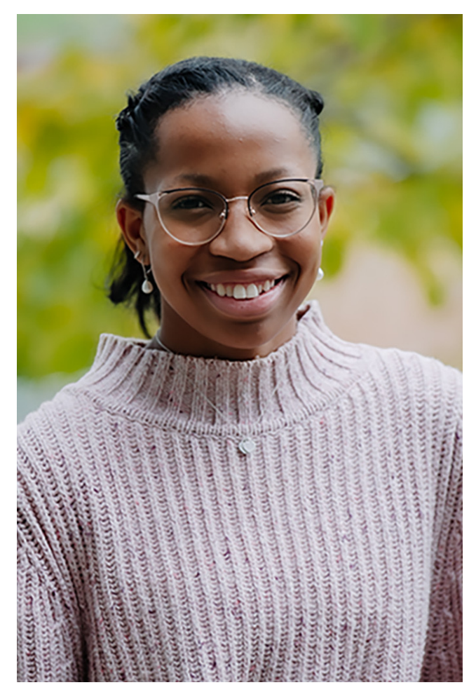
Program Coordinator, Biomedical Innovation