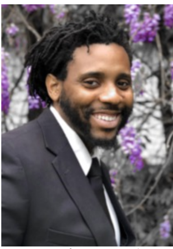
Director of Entrepreneurship and Biomedical Innovation