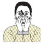
N95 (or PAPR)