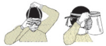
Eye Protection (face shield or goggles)