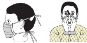
N95 (or surgical mask at check-in area)