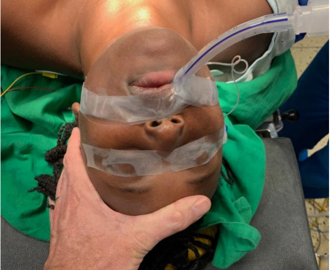
Pushing gently downward on the patient's head after extension of the neck with a head ring and shoulder roll. If the head moves

further, it is supported by the cervical spine and not the head ring. The head ring should be raised to avoid this situation.