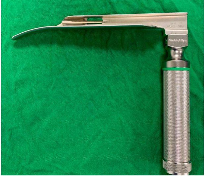
The 4 Miller laryngoscope's blade is a straight lighted tube. It can be used to inspect, biopsy, or remove foreign objects from the hypopharynx, upper esophageal sphincter, and first 5cm of the cervical esophagus.

If one is attempting to visualize only the hypopharynx, upper sphincter, and the first 5cm of the cervical esophagus, it is quite acceptable to use a #4 or larger Miller (straight blade) laryngoscope. This allows one to use the Yankauer suction and the Magill forceps. We frequently use this strategy when removing foreign bodies, when they are lodged in the hypopharynx or at the upper esophageal sphincter.