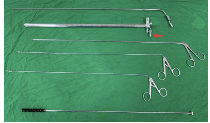
47cm rigid esophagoscope with attachment for fiberoptic light cable (Red Arrow,) suction cannula of suitable length (Top) and brush for cleaning (Bottom.) The upper forceps is for biopsy and the lower two are for foreign body removal. The entire esophagus to the gastroesophageal junction can be inspected with this scope.

Rigid esophagoscopes generally come in various lengths; it is advisable to use the shortest one possible, as visualization and instrumentation becomes more difficult with longer tubes.