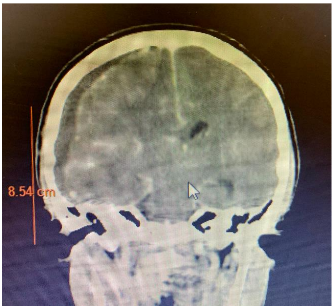
On digital images, a ruler function is usually available. On this Coronal CT scan, the maximum thickness of the subdural hematoma is 8.5cm above the external auditory canal.