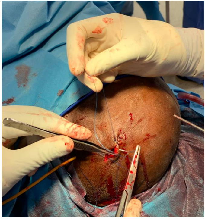
The scalp can be closed in one or two layers. Care is taken to close the Galea and to avoid incorporating the drain in the closure. Direct visualization of each pass of the needle is mandatory.

17. Close the skin and galea. Using a single layer of running monofilament Nylon suture is more hemostatic. Using two layers, closing the Galea with interrupted absorbable suture and the skin subcuticular, has a superior cosmetic appearance. Take care not to entrap the drain in any of the suture.