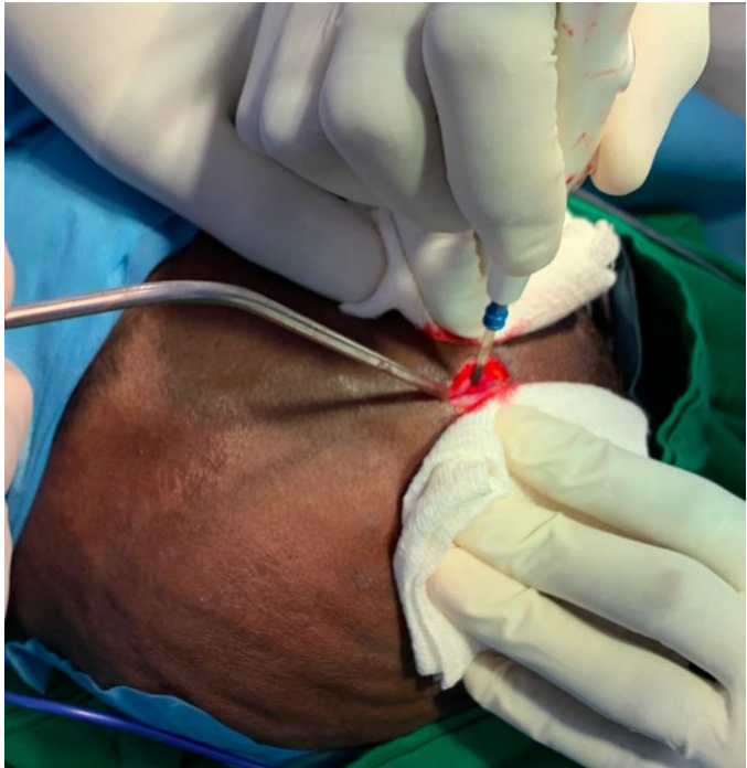
Technique for incising the scalp. The surgeon holds pressure on one side of the incision with the non-dominant hand while using electrocautery to divide the subcutaneous tissue. The assistant holds pressure on the opposite side with the non-dominant hand while using the Frazier suction to keep the field clear.