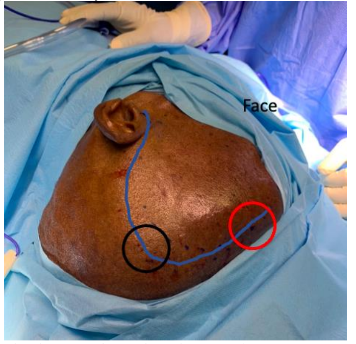
The Blue Line indicates the scalp incision for a craniotomy. A burrhole placed in the area of the Red Circle should be horizontal. A burrhole placed in the area of the Black Circle should be vertical., If conversion from burrhole to craniotomy is necessary, the incisions could easily be integrated into the scalp flap.