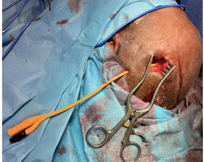
A drain is fashioned by cutting off the tip of a Foley catheter (including the balloon) and adding side holes.

16. Insert a drain through a separate incision and pass it through the dura. A small Foley catheter or red Robinson drain with extra side holes cut in it is acceptable. Make sure to not narrow the catheter too much while cutting the side holes, so it is less likely to fracture while being removed. Irrigate and aspirate gently on this drain to make sure that it is patent, as it can kink during insertion. The drain is placed to gravity.