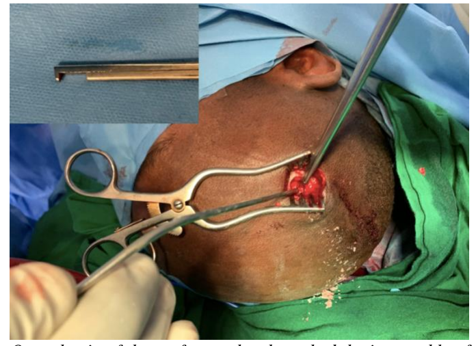
Once the tip of the perforator has breached the inner table of the skull, the most superficial part of the burrhole will be as wide as the widest part of the perforator, with a small defect at the base. The Kerrison rongeur (Inset) is a side-biting rongeur that can be used to widen the base of the burrhole until it is of a uniform width throughout.

11. At this point there is a wide circular defect in the skull with a smaller defect at its base that communicates with the inside of the skull. The Kerrison rongeur is passed through this defect and used to widen it to about 12-14mm.