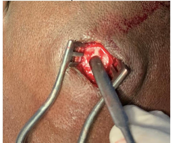
With a self-retaining retractor such as the Weitlaner, the incised scalp is retracted over the periosteum. The periosteum

is then incised and elevated laterally with a periosteal elevator. The retractor is then repositioned to hold the periosteum as well.