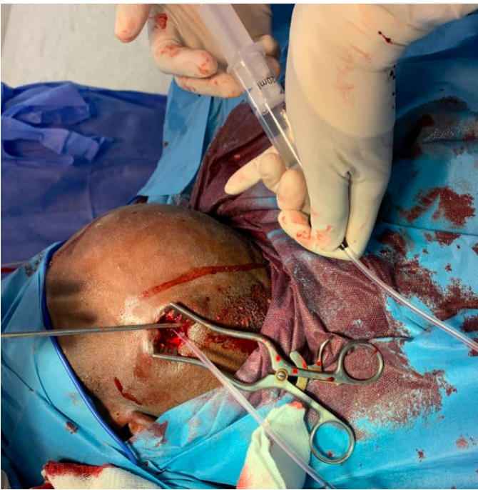
The subdural space is gently irrigated with warm saline through a soft pediatric feeding tube.

16. Insert a drain through a separate incision and pass it through the dura. A small Foley catheter or red Robinson drain with extra side holes cut in it is acceptable. Make sure to not narrow the catheter too much while cutting the side holes, so it is less likely to fracture while being removed. Irrigate and aspirate gently on this drain to make sure that it is patent, as it can kink during insertion. The drain is placed to gravity.