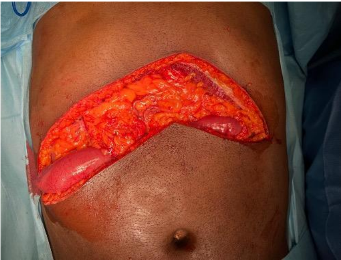
Bilateral subcostal incision, typically used for major hepatic surgery.

Thoracic Epidural is preferred in our institution for: