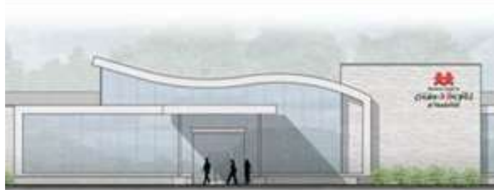
Monroe Carell Jr. Children's Hospital Specialty Clinic & Outpatient Surgery – 37,500 square feet