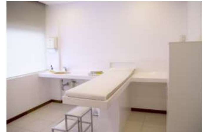
21+ Clinic Expansions by 2021