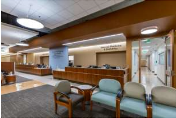
72 New Primary Care Exam Rooms – One Hundred Oaks & Village at Vanderbilt