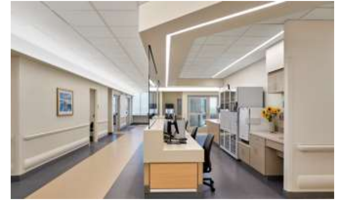
88 more beds by 2020