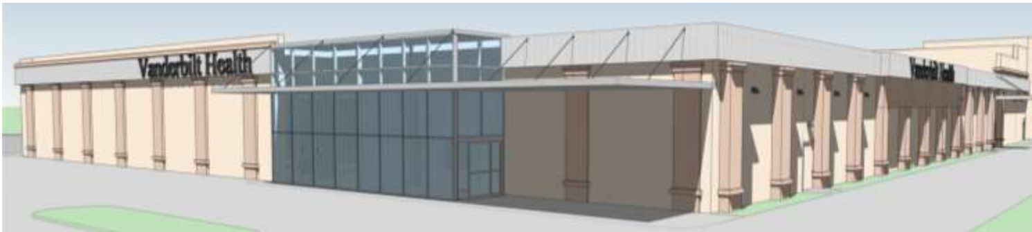
West Nashville Multispecialty Surgery, OR and Infusion – 46,000 square feet