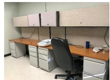
(Inner Office Workstations)