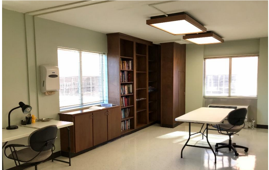
(Main Conference Room of CPE Center at Oxford House)

The new CPE Center at Oxford House is located at OH 1001 just down the hall from the main office of Spiritual and Pastoral Care. The CPE Center will have a main conference space (shown above) for classes and small gatherings. This space will eventually feature a conference table and chairs as well as a big screen monitor for presentations and virtual meetings.