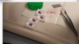
Research Tissue Aliquots