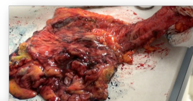
Exposed Colon Tumor