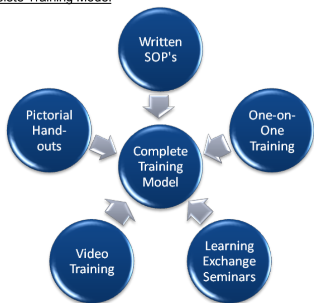
CHTN-WD Complete Training Model

By using video tutorials in the complete training process, CHTN-WD is able to create a holistic approach to training that is effective for a wider range of learning styles and learners. These tools used together create an educational environment and a constant resource for employees to use when needed. These resources serve to reduce error rates, improve employee satisfaction, and promote and support continuity in procurement.