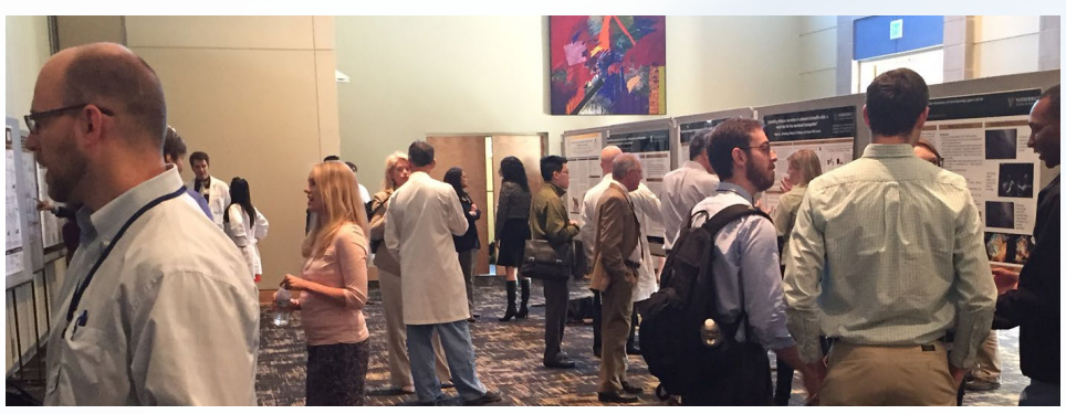
Poster viewing session