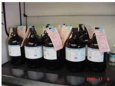
Improper Hazardous Waste Storage. No secondary containment from hood drain, storage in high traffic area.