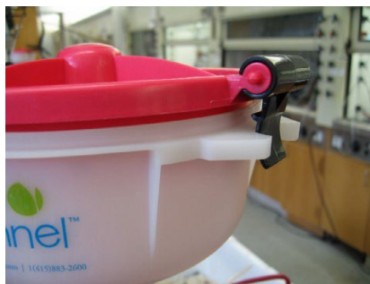
Example of Improper Closure of funnel