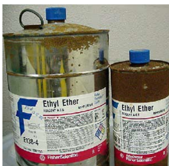
Expired ethyl ether.

Expired ether is one of the most common highly hazardous chemicals found in laboratories. Ether is extremely flammable and can form explosive peroxides after exposure to air and light. Since it is packaged in an air atmosphere, peroxides can form even in unopened containers. Therefore, it is very important to write the date received and the date opened on all ether containers. Opened containers should be disposed of through the OCRS Hazardous Waste Collection Program within 6 months. Unopened containers should be disposed of through the OCRS Hazardous Waste Collection Program within one year. Ether should be stored in the smallest container possible, away from heat and sunlight and any source of ignition, and in a flammable storage cabinet or refrigerator/freezer certified for storing flammable materials.