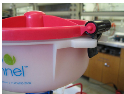
Example of Proper Closure of funnel