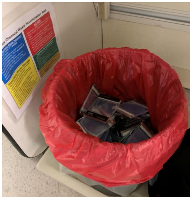
Example of Improper use of a biowaste bag