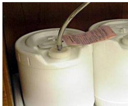
Example of Proper Closure from a continuous process