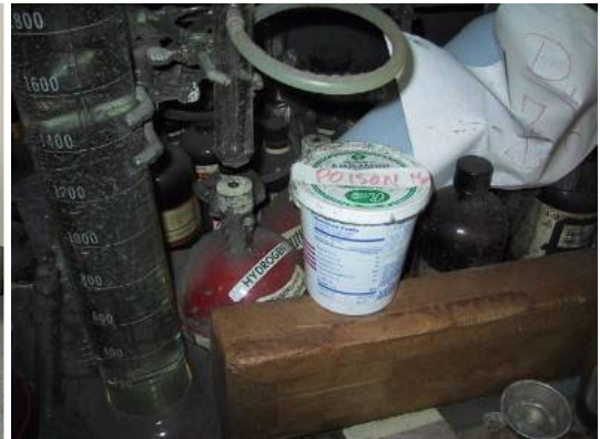
Example of Improper use of a Food Grade Container for hazardous material storage