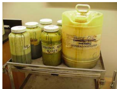
Improper Hazardous Waste Storage. No OCRS labels, no secondary containment, no segregation, and containers are covered with residue.