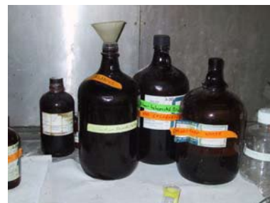
Improper Hazardous Waste Storage. No OCRS labels, no secondary containment, and container not sealed properly (open funnel).