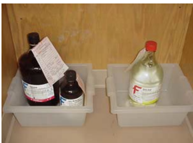
Proper Hazardous Waste Storage. Hazardous waste is labeled, segregated by compatibility, stored in secondary containment, and in an isolated area.

Designate an isolated portion of your laboratory as a hazardous waste storage area. Laboratories with multiple rooms may designate one hazardous waste accumulation area for all rooms only if hazardous waste will not have to be transported in or across a public hallway or through any area that is not controlled by the lab. Hazardous wastes must be stored with secondary containment so that spills cannot reach sink, hood, or floor drains. Incompatible hazardous wastes must be segregated to prevent reaction. Segregation methods include storing in separate cabinets, storing in separate hoods, or storing in separate secondary containment containers such as 5-gallon buckets or tubs. Please refer to your laboratory's Chemical Hygiene Plan or the OCRS website for guidelines on segregating chemicals by hazard class.