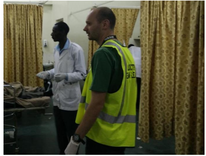
A Yellow vest allows the Physician-in-Charge to be easily identified even in a chaotic environment. The Nurse-in-Charge wears one as well.

The Nurse-in-Charge and Physician- in-Charge work closely together. Neither takes care of an individual patient. They conduct the mass casualty event itself and should be not distracted by the needs of a singular patient. During the event, these two "in-Charge" leaders coordinate the entire team's roles, ensure proper management and triage, and monitor crowd control.