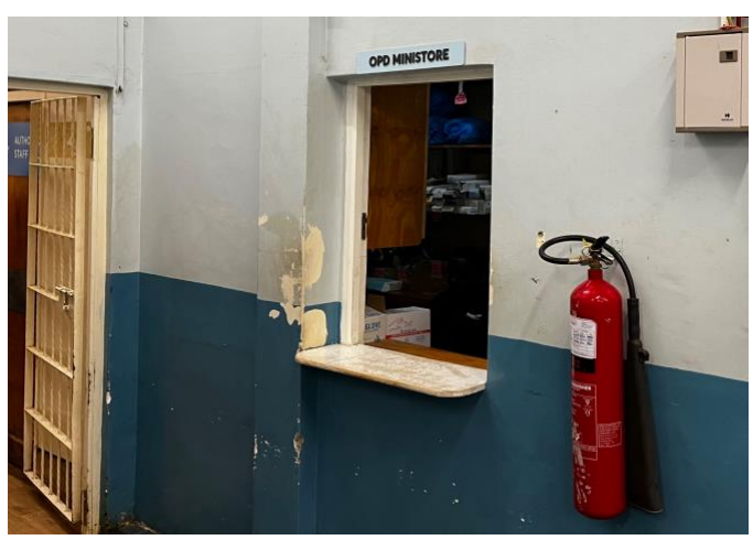
This "ministore" serves the adjacent outpatient and casualty departments. It is staffed full-time and contains enough emergency supplies for a mass casualty, rapidly available. The clerk knows every piece of equipment and can access it rapidly. The Central store is elsewhere in the hospital and can replenish the ministore in real time if needed.

Casualty Store: A room, adjacent to the casualty, staffed by a clerk, where such equipment is always stored and disbursed for patient care during all hours. By design, there is enough equipment available for surges such as a mass casualty even though these happen rarely. The advantage of this system is that it allows equipment to be rapidly available, and some measure of inventory and cost allocation is available even during a mass casualty event. Also, the equipment can be easily located, since the clerk knows quite well where everything is. The disadvantage is that it requires a full-time employee staffing the store; if a hospital's Emergency Department is not very busy, maintaining this employee may not be a justified expense.